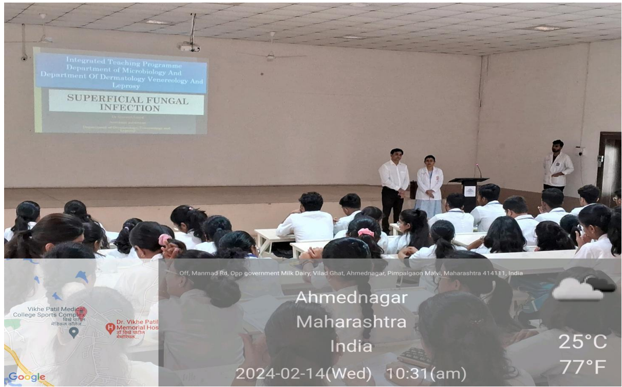
Padmasree Lecture Hall