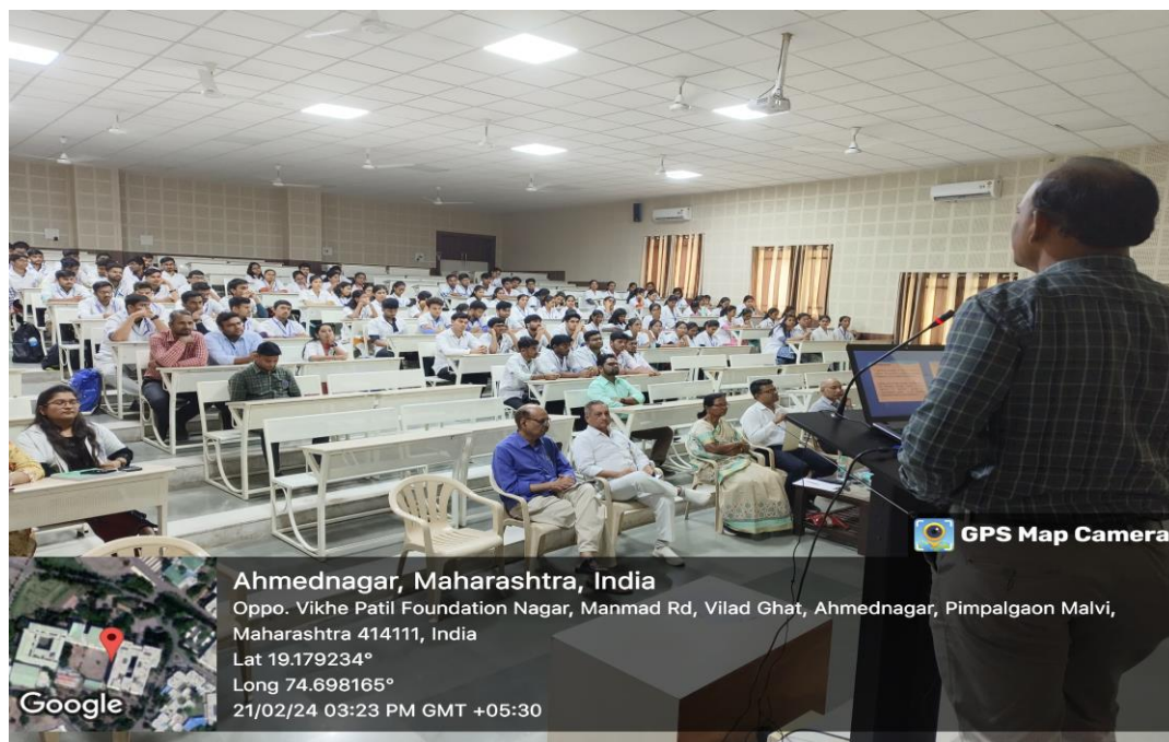
Charak Lecture Hall