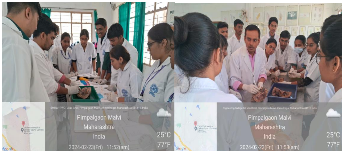
Anatomy Dissection Hall