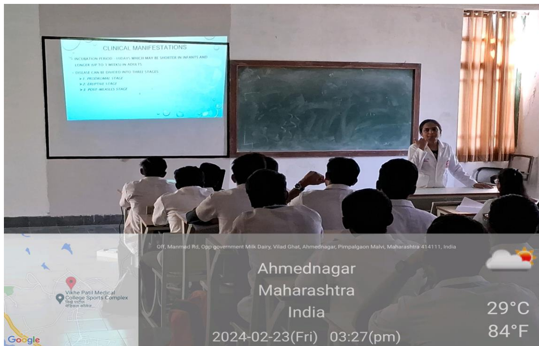
Microbiology Demonstration Room