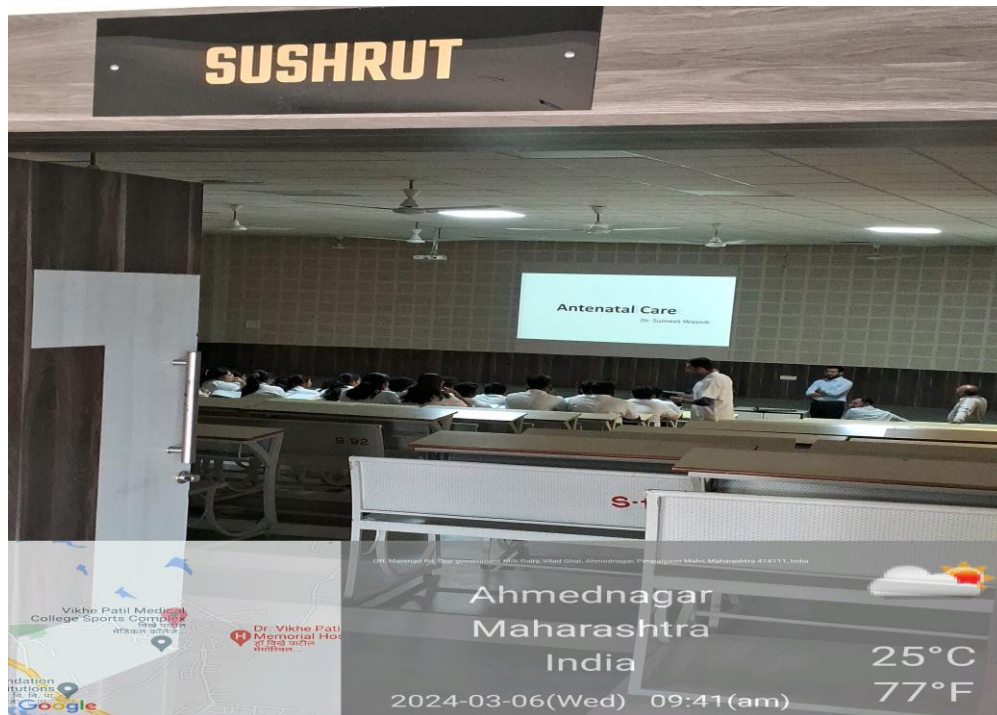
Sushrut Lecture Hall