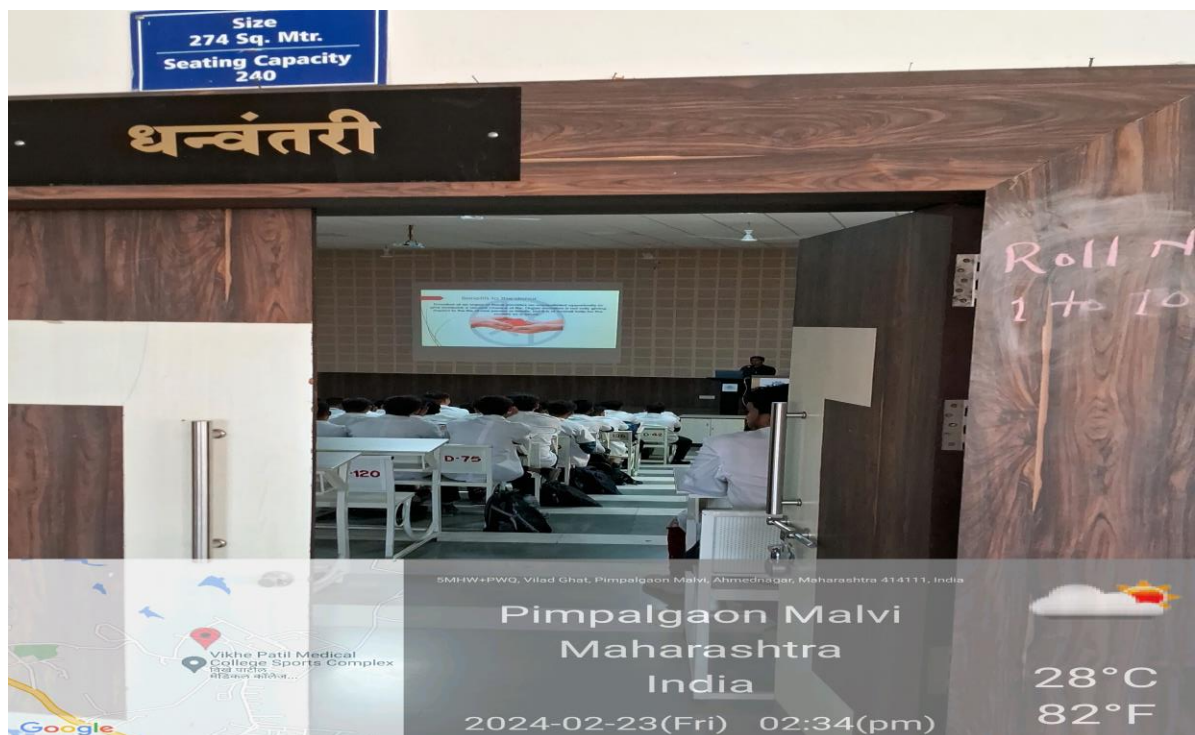
Dhanwantari Lecture Hall