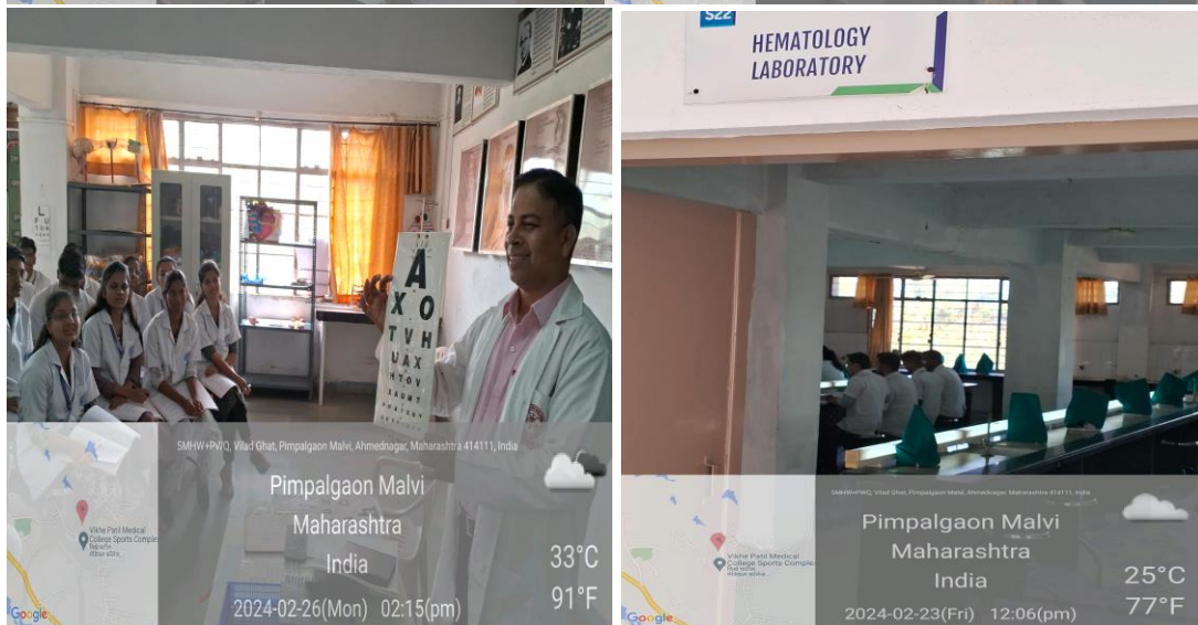
Clinical Learning Facilities for Students