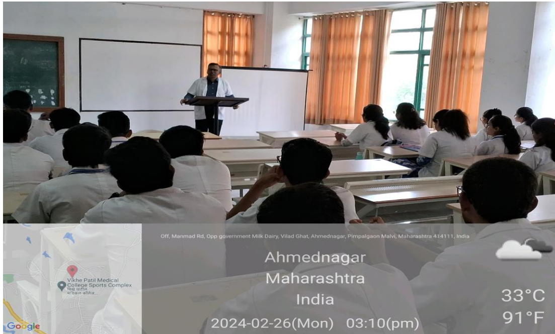
PATHOLOGY DEMONSTRATION HALL