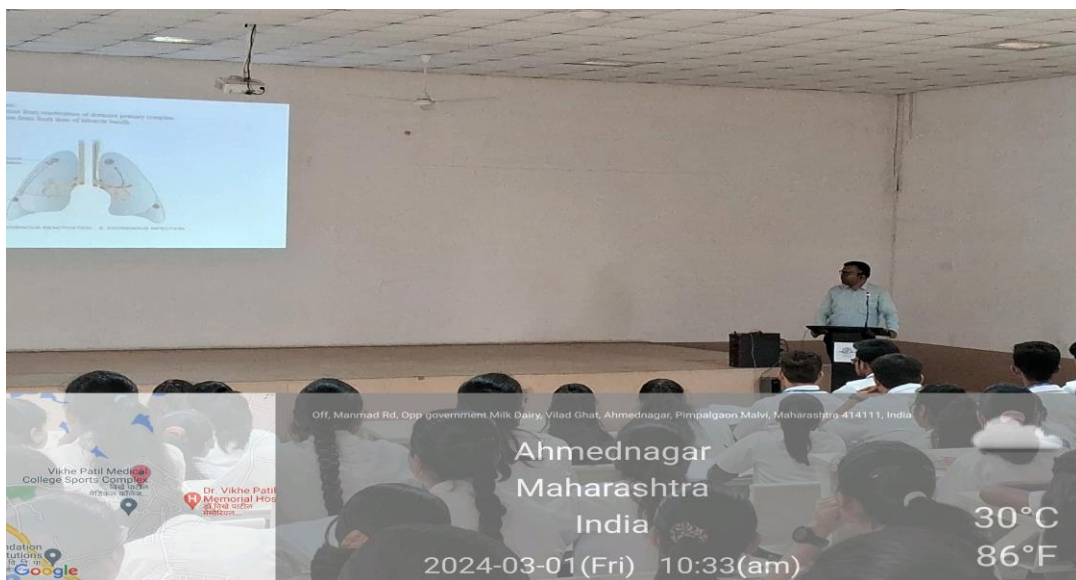
PATHOLOGY LECTURE IN PADMASHREE LECTURE HALL