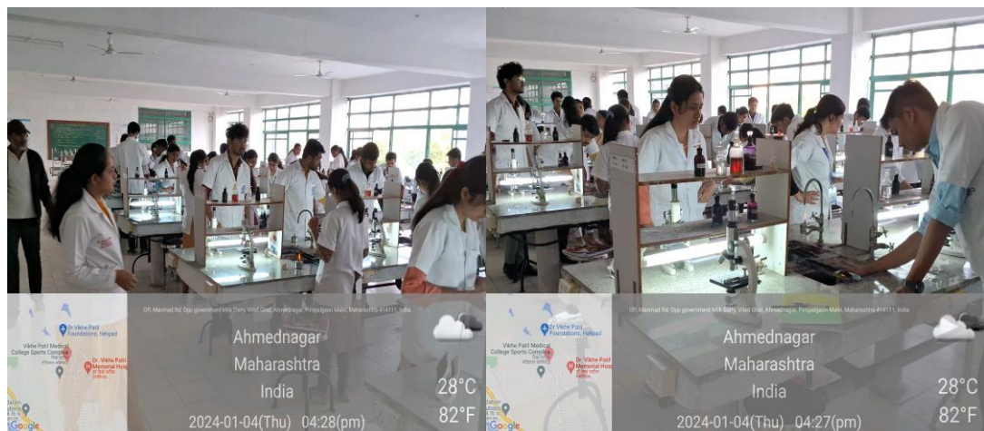
Microbiology Student Practical Hall